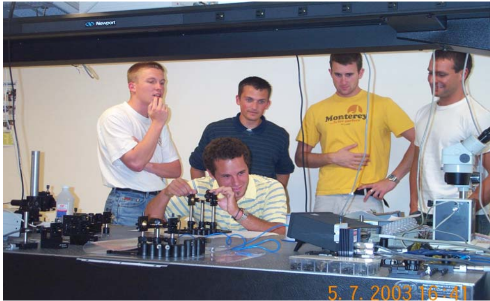
Fig. 2. Students experimenting with the optical communication link (Lab 7).

own in 1.5 hours. Having the link set up so that students see it working and then take some measurements allows them to focus on understanding rather than getting too frustrated by the alignments. The USD students were impressed with the French students' skill at using PowerPoint to animate graphics in their description of the multiplexer and felt it enhanced their own understanding of the technical content. After their own attempts to align light to fibers, they were especially impressed with the French students' experimental skill in assembling a complicated setup.