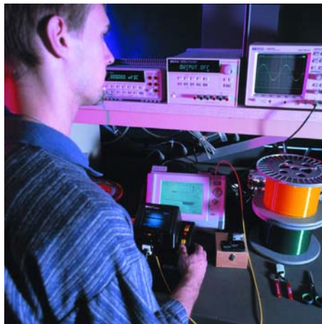
Fig..1 Students practice fiber splicing and use of the OTDR in the Lightwave Communications Lab (1999)

The shared physics and electronics laboratories were clearly inadequate to house all the new equipment. An under utilized electronics laboratory was remodeled into classroom/laboratory space to house the program laboratories. Walls were painted dark charcoal gray and room darkening shades were purchased for the large windows. Movable wooden screens were built to serve as laser beam blocks. The adjoining faculty office allowed the classroom to be used between classes by students, who were encouraged to use the space to study, for internet access or to work on projects. Allowing students to use the classroom space to work together during their free time fosters a feeling of belonging. As one student stated, "We're the only program that has its own 'club house'." Nearby instructors are able to provide assistance when needed and ensure that rules are obeyed.