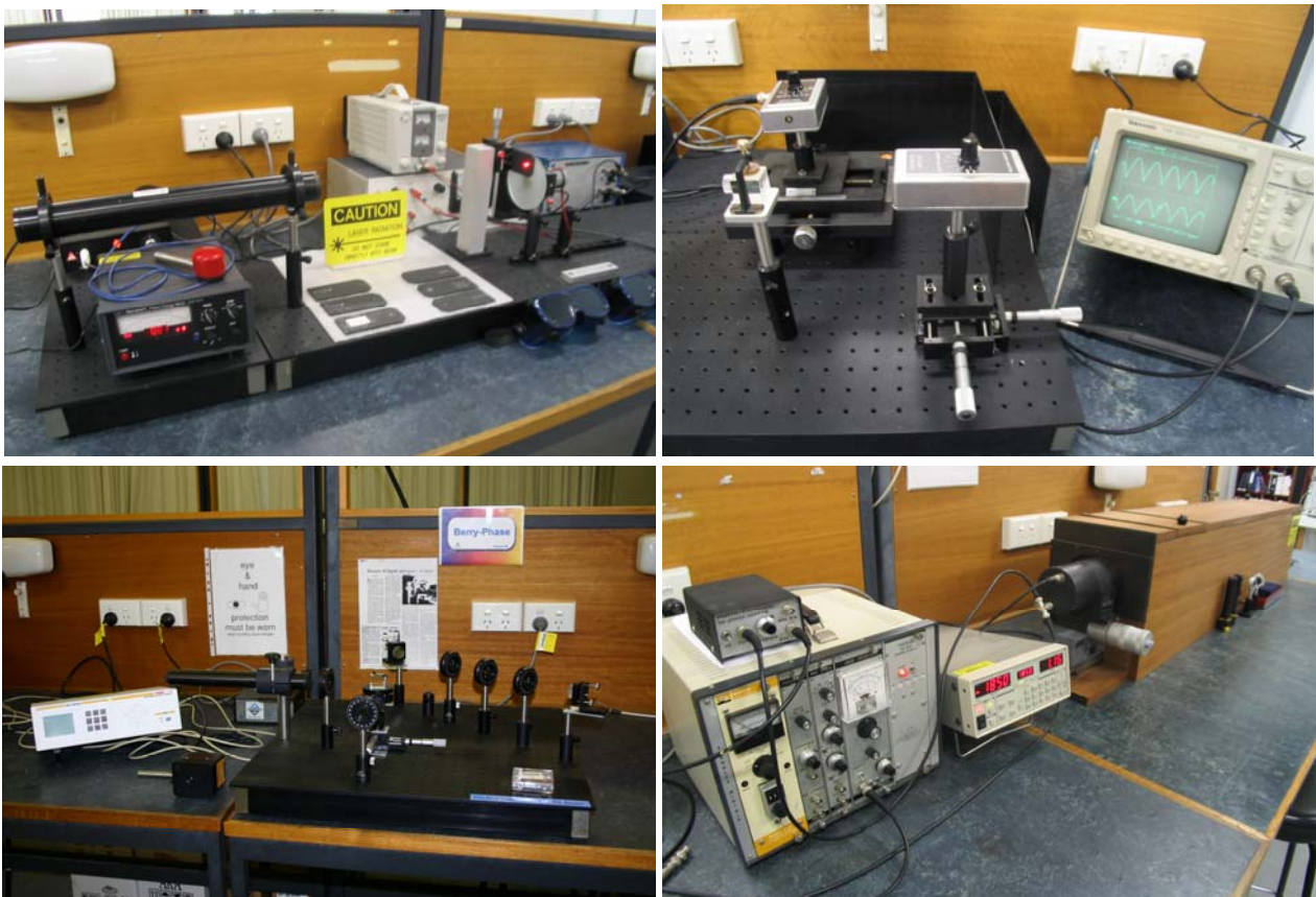
Fig. 2 Experimental setups for the Correlation interferometry (top), Polarisation and Berry phase (bottom left), and photon counting and interferometry (bottom right) experiments in the undergraduate optical physics laboratory, Department of Physics, Macquarie University.