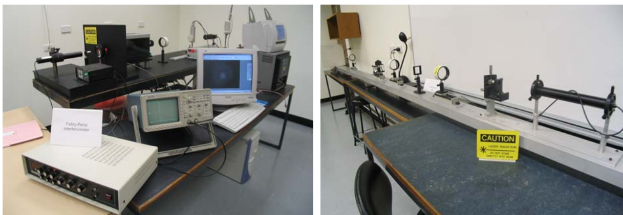
Fig. 1 Experimental setup for the Fabry Perot (left) and optical data processing (right) experiments in the undergraduate optical physics laboratory, Department of Physics, Macquarie University.

Third year students of Optical Physics undertake experiments selected from Optical Data Processing (Diffraction and Image Formation); Fourier Transform Spectroscopy; Fabry Perot Interferometry; Polarisation & Berry Phase; Holography; Correlation Interferometry & Spatial Coherence; Single Photon Counting and Interferometry; and Photonics Simulation Software for Teaching [1]. Pictures of some of the bench layouts for these experiments are shown in figures 1 and 2. Students write major reports on two of the experiments they complete, following the guideline for report writing developed as a consensus document within the department [2]. These reports and the lab book record of four completed experiments are major assessments that are included in a learning portfolio for the unit which the students have to complete.