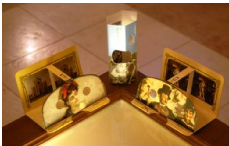
Fig.1. Examples of simplest stereoscopes

This entire educational complex based on a combination of education, research activities and games, and having a clear business plan, should become, in our view, the prototype of the centers attracting young people to science and technology, whether to optics, aerodynamics or acoustics.