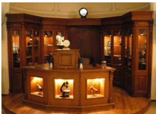
Fig.6. Centre view of the second hall