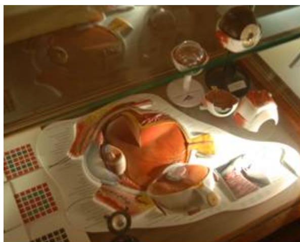
Fig.7. Case with eye-models