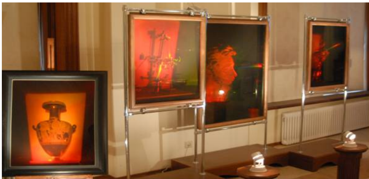
Fig.5. Part of the first hall holographic collection