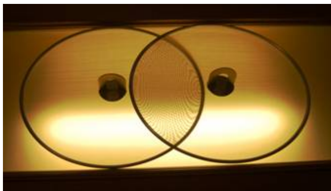
Fig.3. Simple demonstration of interference