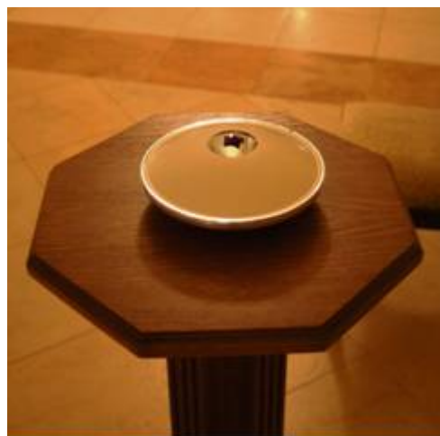
Fig.2. 3D illusion formed by two parabolic mirrors