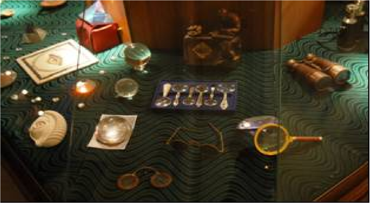
Fig.8. Ancient crystal balls, reading stones & glasses