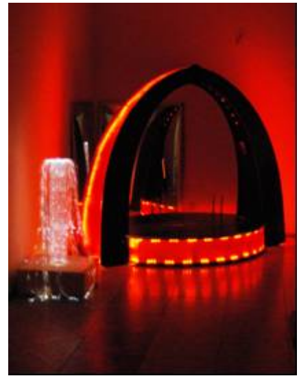
Fig.10. Laser harp as a harmony of Light & Music