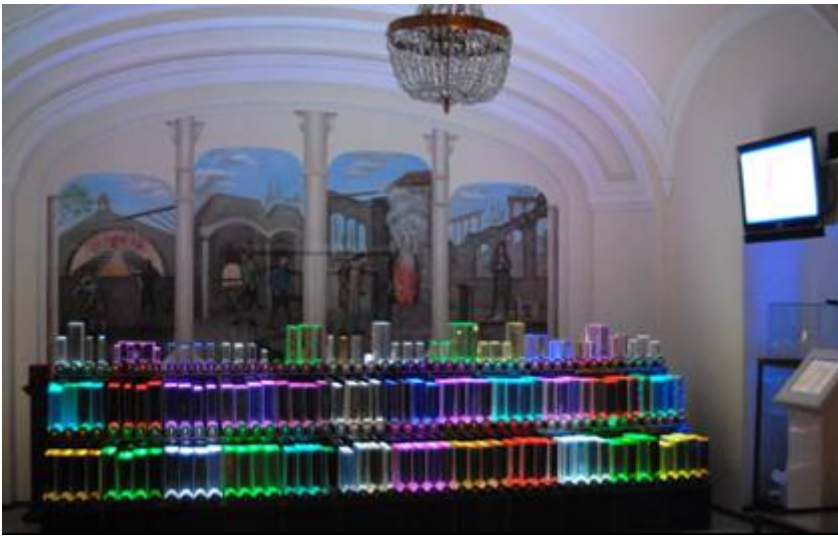
Fig.9. View of famous Abbe-catalog