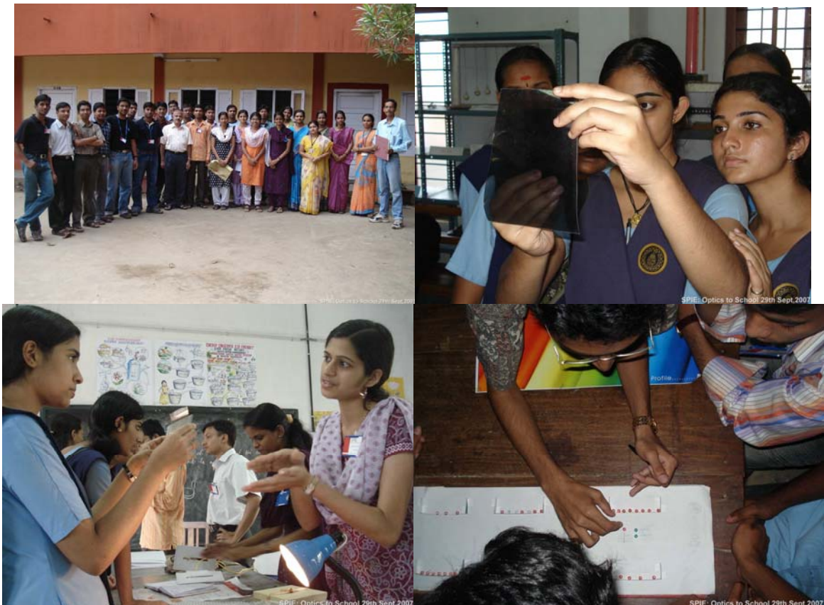
Figure 2: Photos of Optics to School program

This program is designed to run as a whole day program in a school. A group involving 20 to 30 volunteers would go to the school and setup the experiments mentioned in the previous section, depending on the target audience. The program starts with a presentation in order to introduce the students to the objective of this program. Also students would be shows presentation of various fascinating development happening in the field of optics and Photonics at present.