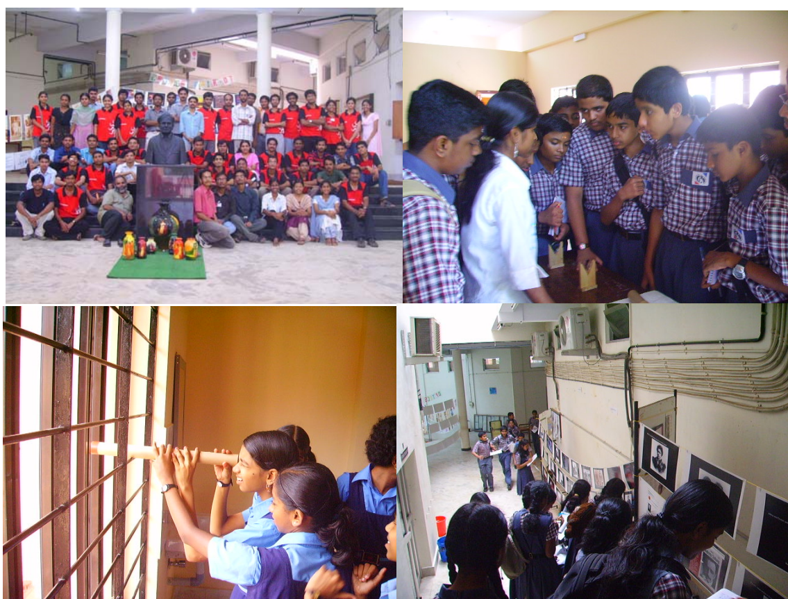
Figure 3: Photos from Optics fair 2007

The program gained very enthusiastic and positive response for past four years. Students showed enthusiasm to get involved in the activities included in the demonstration session and they actively participated in the discussions. Students came up with interesting doubt which is the proof that the program was successful in invoking the inquisitiveness in students. The feedback obtained from teachers was also overwhelming. They considered this program as a way to sharpen their knowledge. Also this activity based instructional package acted as a supplement to the standard textbook which made further teaching easier.