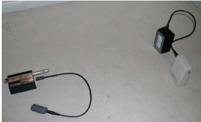
Figure 3: The new communication system

The new system is being manufactured by Green Valley Electronics in Tucson.