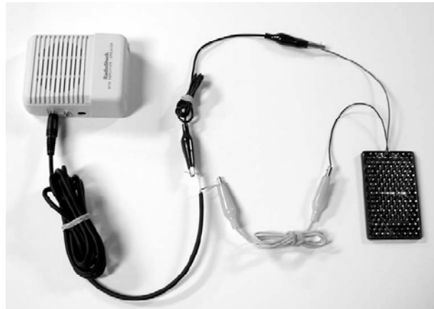
Figure 1: The receiver unit

To hook up the circuit, connect the microphone to the 8\Omega side of the resistor. The laser is connected to the center tap of the 1000\Omega side of the resistor and one of the end wires. One of the wires is connected to the laser's clip and one is connected to the laser's body. For the wire connected to the clip, be sure it does not accidentally touch the laser body and create a short circuit (you will not damage the laser, but it will not modulate and the system will not work).