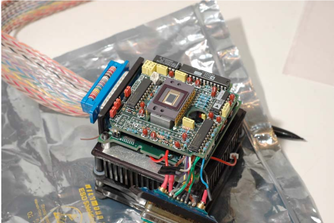
Figure 2 : An assembled camera without the housing case. Clearly seen is the upper board with the CCD sensor (KAF 0402ME) inserted. Below it is the lower board and below that the cooling assembly including the peltier cooler (not seen) and the fan assembly.

The students are provided with all the components and instructions to fabricate this peltier cooled, computer controlled CCD camera. Most of the components are fairly easy to obtain through electronic resellers at a moderate cost or they can be obtained as a package of components from Genesis. An additional benefit of building the Audine designed camera is that there are many news groups dedicated to issues surrounding construction of this system. Students in this class have interacted with other builders of these cameras from around the world.