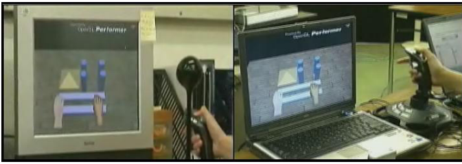
Figure 2. Two users at a distance from each other collaborate effectively over the Internet without voice communication.

still work together effectively. We also concluded that compared to analog devices like joysticks, a 3D device like the space interface device for artificial reality (SPIDAR) 7 is more intuitive for a task where people are faced with a set of objects to select and move. Moreover, an immersive display environment is more suitable than a non-immersive display for simulating object manipulation that requires force and the feeling of weight.