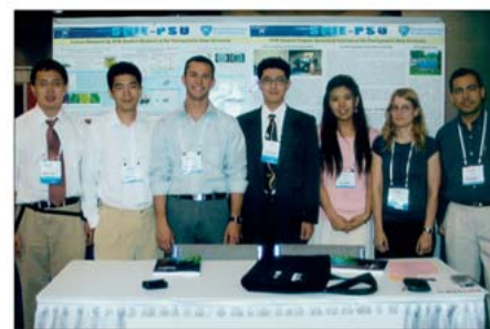
Pennsylvania State University Chapter at Optics+Photonics.