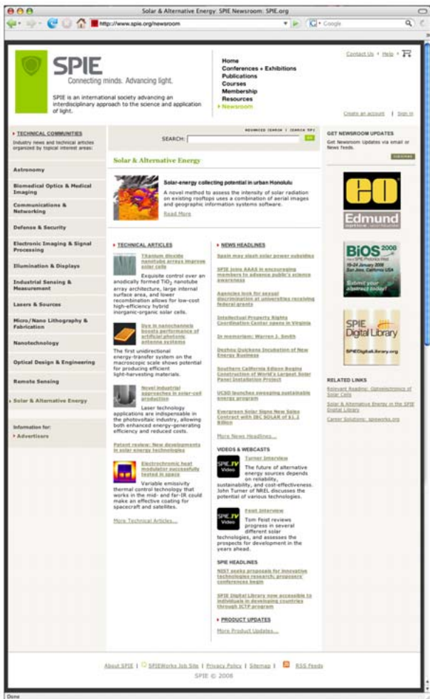
Technical Community landing page